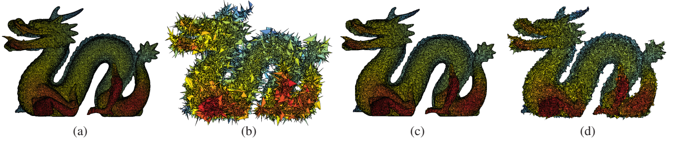
Fig. 1. (a) Original mesh \bar{\mathbf{x}} , (b) noisy mesh \mathbf{z} with \text{MSE} = 2.89 \times 10^{-6} , and reconstructed meshes \hat{\mathbf{x}} using (c) Algorithm 1 with \text{MSE} = 8.09 \times 10^{-8} and (d) Laplacian smoothing with \text{MSE} = 5.23 \times 10^{-7} .