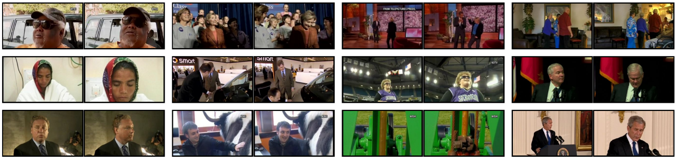
Fig. 1. Positive pairs. Some examples of matching pairs formed by images from the groups of CNN News Footage dataset. They span a variety of scenes, from close-ups to full shots, from empty to cluttered background, and of intra-pair variations, from small camera/object movements to large scene changes due to pose variations or object movements.