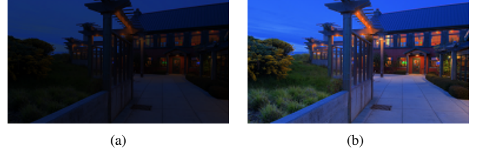
Fig. 1: The same scene tone mapped by applying Eq. (4) to (a) the grayscale and (b) V image channel.

In [25] it was shown how the quality of results of global TMOs can be significantly improved by applying them to the V channel of the HSV colorspace instead of applying them to the Y channel of the YUV colorspace. For this reason in the rest of the paper Eq. (4) will be applied to the V channel and an example of such an application is given in Fig 1.