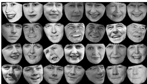
Fig. 1. Face images depicting four speakers of the extended TCDSA dataset at ascending ages.

The collected face images were resized to 60 \times 60 pixels and the face was cropped in order to remove background. All face images were converted to grayscale. Some examples of the collected face images for four speakers of the extended TCDSA dataset are depicted in Figure 1. Pose and illumination vary greatly over the collected face images, as can be observed by the sample face images depicted in Figure 1. To the best of our knowledge, the extended TCDSA dataset that combines age separated speech samples and face images, is a unique dataset that supports bimodal age estimation experiments using aural and visual features.