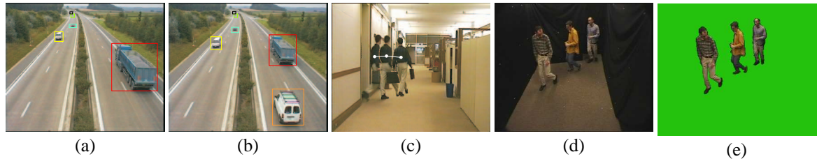
Figure 1: (a) and (b): samples of ground truth for tracking evaluation through bounding box for ‘Highway’ video sequence. (c): sample of ground truth for tracking evaluation through center of gravity for ‘Hall’. Sample of original video sequence ‘Group’ in (d) and the corresponding ideal object segmentation (ground truth) in (e).