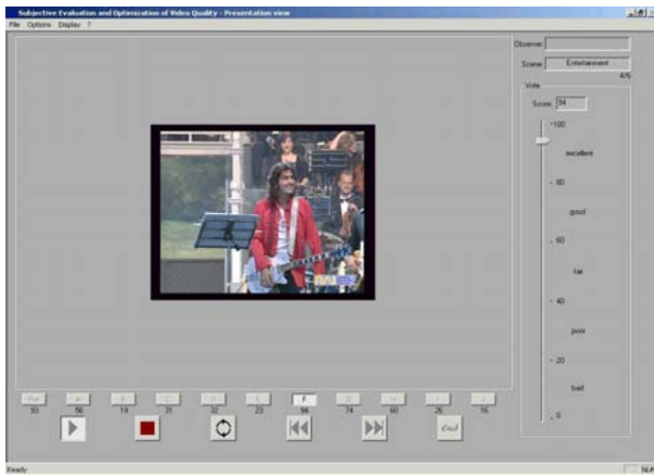
Figure 2 - SEOVQ User Interface.

systems. Further, there is no continuous sequential presentation of items as in double-stimulus-continuous-quality-scale (DSCQS) method: this characteristic reduces possible errors due to a lack of concentration, thus offering higher reliability. Nevertheless, since each sequence can be played and assessed as many times as the observer wants, it is time consuming and less conditions can be tested during a session.