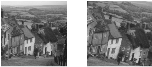
(a) Image X .