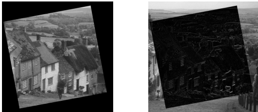
(a) Registered version of Image Y . (b) Prediction error after registration of Y .