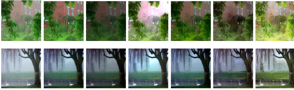
Fig. 4. Results on natural reference-free images. From left to right: hazy image, Huang et al., Zhu et al., DehazeNet, AOD-net, Li et al., CWGAN