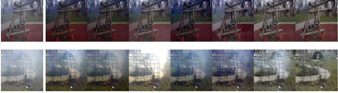
Fig. 3. Results on natural images. From left to right: hazy image, Huang et al., Zhu et al., DehazeNet, AOD-net, Li et al., Proposed, Ground truth