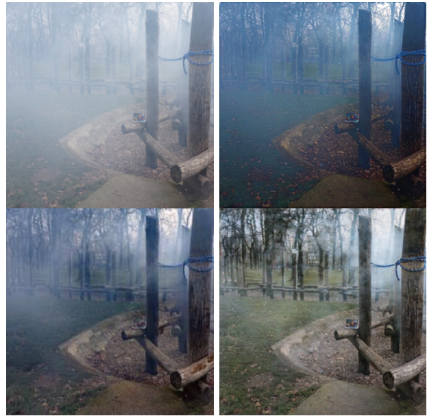
Fig. 1. Clockwise from top left: Foggy image, Huang et al.'s method, Proposed, Li et al.'s method

Haze-removal from a single image is thus an ill-posed problem, because it requires knowledge of the scene depth d(x, y) as well the fog extinction coefficient k . A number of fog-removal methods [2], [3] thus require multiple images of the same scene and calibrated cameras. On the other hand, single image fog-removal techniques rely on different priors in order to solve this under-constrained problem. He et al. proposed the dark channel prior [4], which assumes that the minimum intensity value across color channels in a patch is near to 0 in a clear, natural image. This prior has been widely used in conjunction with the Koschmeider law to obtain an initial estimate of the airlight map which is further refined by various methods and used to restore the image. The prior naturally fails when there are bright objects in the scene. We propose a deep